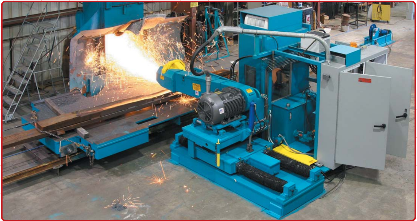
Model 6040S Stationary Grinder - 90°